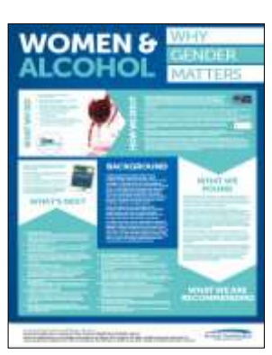
Alcohol Healthwatch poster presentations

The following is a summary of the highlights and key themes of the conference.